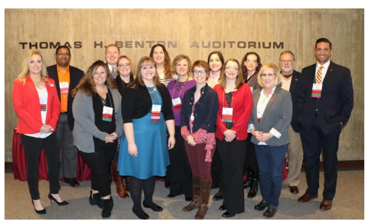
The 2018 Professional and Scientific Council Professional Development Conference Sub-Committee

Visit our <u>Facebook page</u> to see photos from this year's conference and while you're there, be sure to like the page! It's an easy way to keep up with Professional and Scientific Council happenings.