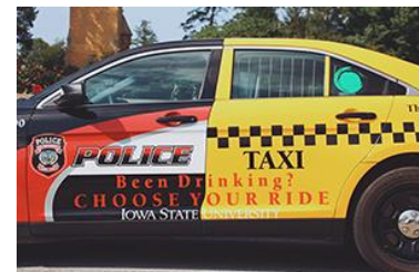
The ISU Police Taxi for those who've had too much to drink is one of many services provided.