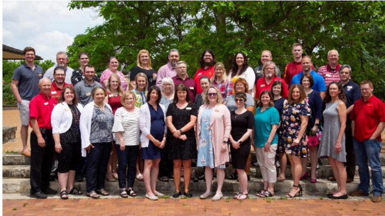
Your 2019-2020 Professional and Scientific Council

To view a full list of elected councilors and the areas they represent, visit the P&S Council website .