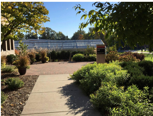
The entry area of Horticulture Hall.